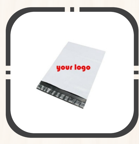
Screen Printed Courier Bags