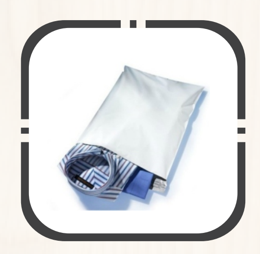
Air Bubble Packaging Bags