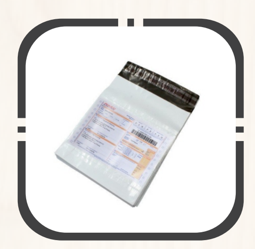
LDPE Flap Courier Bag