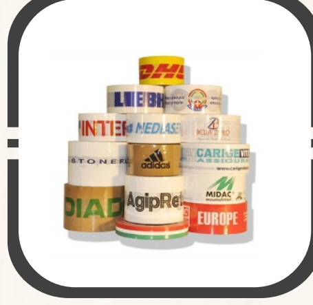
Printed BOPP Tapes