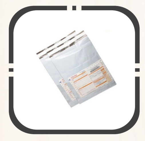
Polythene Security Bags