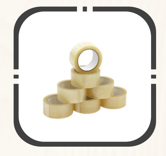
BOPP Packing Tapes