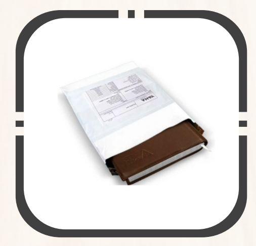
Pod Courier Bags