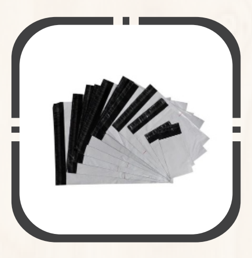
Economy Tamper Proof Courier Bags