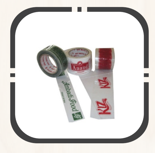
Customized Printed BOPP Tapes